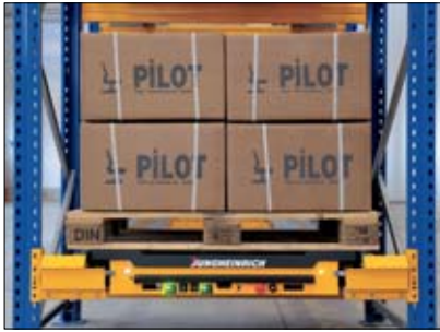
Start of storage