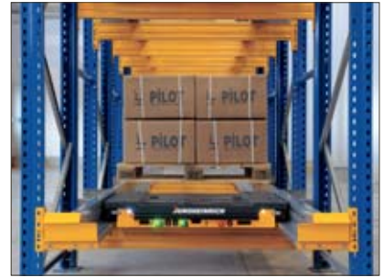
UPC returns to the beginning of the channel