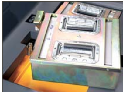
Easy battery change

The battery charger of the carrier ensures easy charging at any 230 V mains socket. Dependent on the intensity of the application, the carrier with a fully charged battery set is operational for eight to ten hours. An additional second battery – in combination with a battery changing station (optional) – significantly increases the application time in 2- and 3-shift operations. Battery change is carried out in seconds due to the battery container.