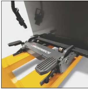
Professional battery management